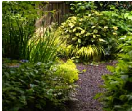
Fusion landscaping is an innovative trend that is much easier on your water bill.

Fusion landscaping is the newest trend in landscape and garden design that combines "the lush splendour of traditional gardens with modern, eco-friendly plants, flowers, colours