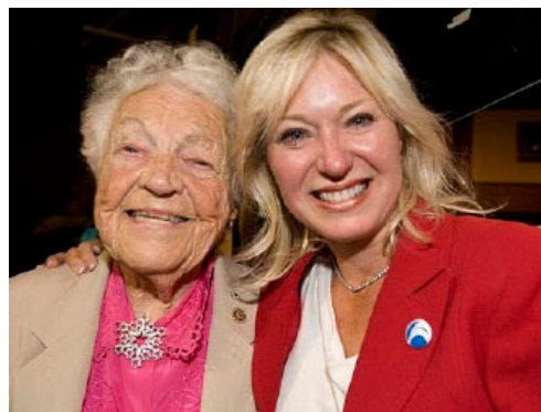
Out-going Mayor Hazel McCallion with in-coming Mayor Bonnie Crombie.

The RHA would like to congratulate all those elected to serve Mississauga residents in public office and we look forward to working with our members of Council in the four years to come. On behalf of the RHA, we would also like to extend our deepest thanks to Mayor Hazel McCallion for her dedication and commitment to the City of Mississauga over nearly four decades representing our city. RW