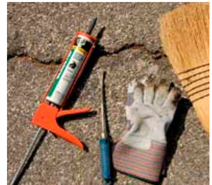
Tools needed to fix the driveway cracks

Often, with a poor quality sealing job, this could happen.