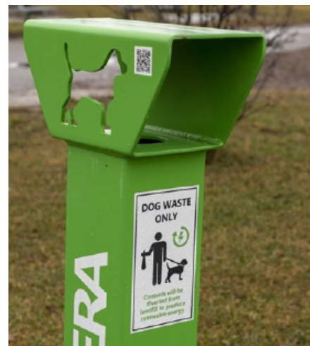
The city's dog poop containment systems, like this one seen in Churchill Meadows, are used to collect dog waste without smell and ultimately, convert the waste into electricity.

the City decides. It may not be a cost effective energy program; however, removing carbon from the atmosphere and reducing the amount of waste that goes to landfill are definitely worthwhile causes. RW