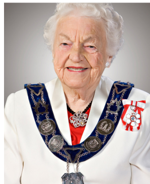
Hazel McCallion February 14, 1921 - January 29, 2023

Beloved former Mississauga Mayor, Hazel McCallion was laid to rest on what would have been her 102nd birthday. According to Former Prime Minister, Jean Chretien, "She had a big heart and it was no coincidence that she was born on February 14."